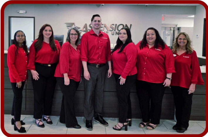
BACK OFFICE TEAM